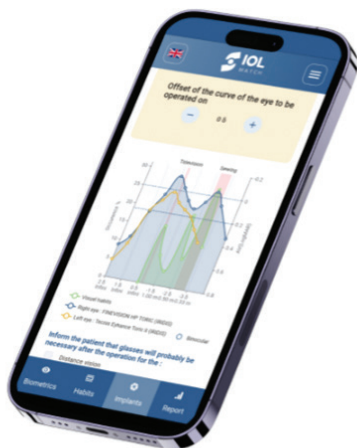
Figure 1. The IOL Match interface displaying a comparison of defocus curves on a smartphone.