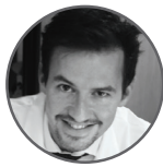
DAMIEN GATINEL, MD, PHD

It is important for surgeons to understand the difference between Q values, corneal SA, and whole eye SA. An eye with a high negative Q value has high positive corneal SA but negative whole eye SA. Such an eye has increased depth of focus even with an aspheric IOL.