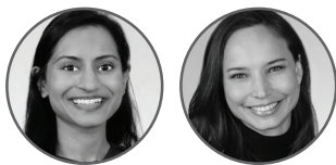
MIRA AMIN, MD, AND KAROLINNE MAIA ROCHA, MD, PHD

When determining patient candidacy for a multifocal IOL, it is imperative to consider their lifestyle, examine them for ocular surface disease, and assess their optical quality. Figure 1 shows that the patient has high myopia (evidenced by long axial length) and flat (oblate) corneas with residual oblique astigmatism (astigmatism measured by total keratometry was 2.35 D @ 43°). Figure 2 shows a relatively regular bow tie appearance to the astigmatism within the visual axis and high positive spherical aberration in each eye, likely a result of the myopic ablation with a small optical zone. Increased corneal spherical aberration like this can lead to suboptimal postoperative results with multifocal IOLs. Given the irregular astigmatism and greatly increased spherical aberration, it is surprising that the patient's uncorrected distance visual acuity is 20/25 OS.