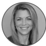
LISA K. FEULNER, MD, PHD

This situation is complicated but unfortunately not as uncommon as one might think. A number of variables must be considered before counseling this patient. Each lens appears to be a one-piece acrylic multifocal with notable glistenings. In each eye, the capsulorhexis is large, a round posterior capsulotomy is present, and there is obvious fibrosis of the anterior capsule. Additionally, both eyes have significant residual refractive errors with anisometropia. There is really no option other than an IOL exchange to address decreased BCVA caused by opacification of an IOL due to glistenings.