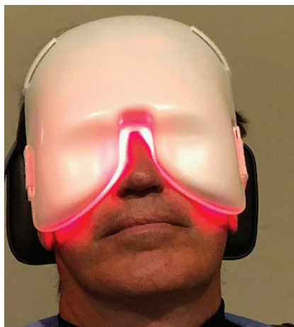
Figure 2. The mask application during LLLT.

I like LLLT because it is efficacious and easy to perform. Further, unlike IPL, LLLT can be effective regardless of the patient's skin color, and it can be repeated if patients do not