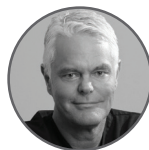
RICK WOLFE, FRACS, FRANZCO

Lenstar (Haag-Streit). Roughly 1.50 D of correction is required, but 0.50 D increments often are not available for low power ranges. An argument can be made for implanting a 2.00 D IOL, which would leave this patient slightly myopic. My strategy, however, would be to implant a 2.00 D LI61AO SofPort IOL (Bausch + Lomb) because this silicone lens is available in low powers. I would expect the procedure to be straightforward.