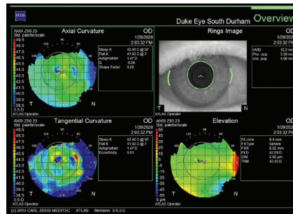
Figure 1. Corneal topography of the right eye shows mild to moderate tear film instability.

The patient greatly desires surgical correction of his hyperopic right eye. The ocular surface of that eye is dry (Figure 1). Additionally, there is a mild recurrence of pterygium with scarring and neovascularization that is not visually or