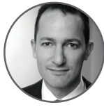
TAL RAVIV, MD

Refractive surgical options for a patient with early presbyopia and very high hyperopia are usually limited to lens-based procedures. An RLE with a correctly powered presbyopia-correcting toric IOL would be the ideal solution. US surgeons have access to toric versions of bifocal multifocal, trifocal, accommodating, and extended depth of focus IOLs, but the upper limit of available powers is 34.00 D. This patient would therefore require secondary hyperopic corneal refractive surgery or a piggyback IOL. I am not a fan of primary piggyback IOLs because of the chance of pigmentary dispersion. I also avoid performing hyperopic corneal laser vision correction of more than 2.50 D because of the risks of long-term regression, lack of accuracy, and ocular surface problems with a steepened corneal curvature.