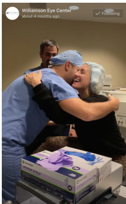
Figure 3. Be sure to capture the wow moment immediately after a life-changing procedure.