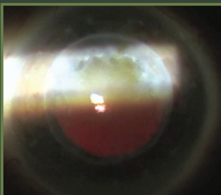
Figure 2. Slit-illumination on the surgical microscope reveals some red reflex, allowing cataract surgery to proceed.