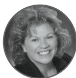
P. DEE G. STEPHENSON, MD, FACS

If I was able to safely remove the nucleus in its entirety through an anterior approach, I would then use an Ahmed Capsular Tension Segment (CTS, Morcher, US distributor FCI Ophthalmics) with scleral fixation to stabilize the intact capsule. In some cases, two or even three CTSs may be needed to create 360° stability of the capsule complex. My preference would be a three-piece IOL because its spring-like haptics would provide some tension within the capsule. A three-piece IOL would also allow scleral or iris fixation if needed.