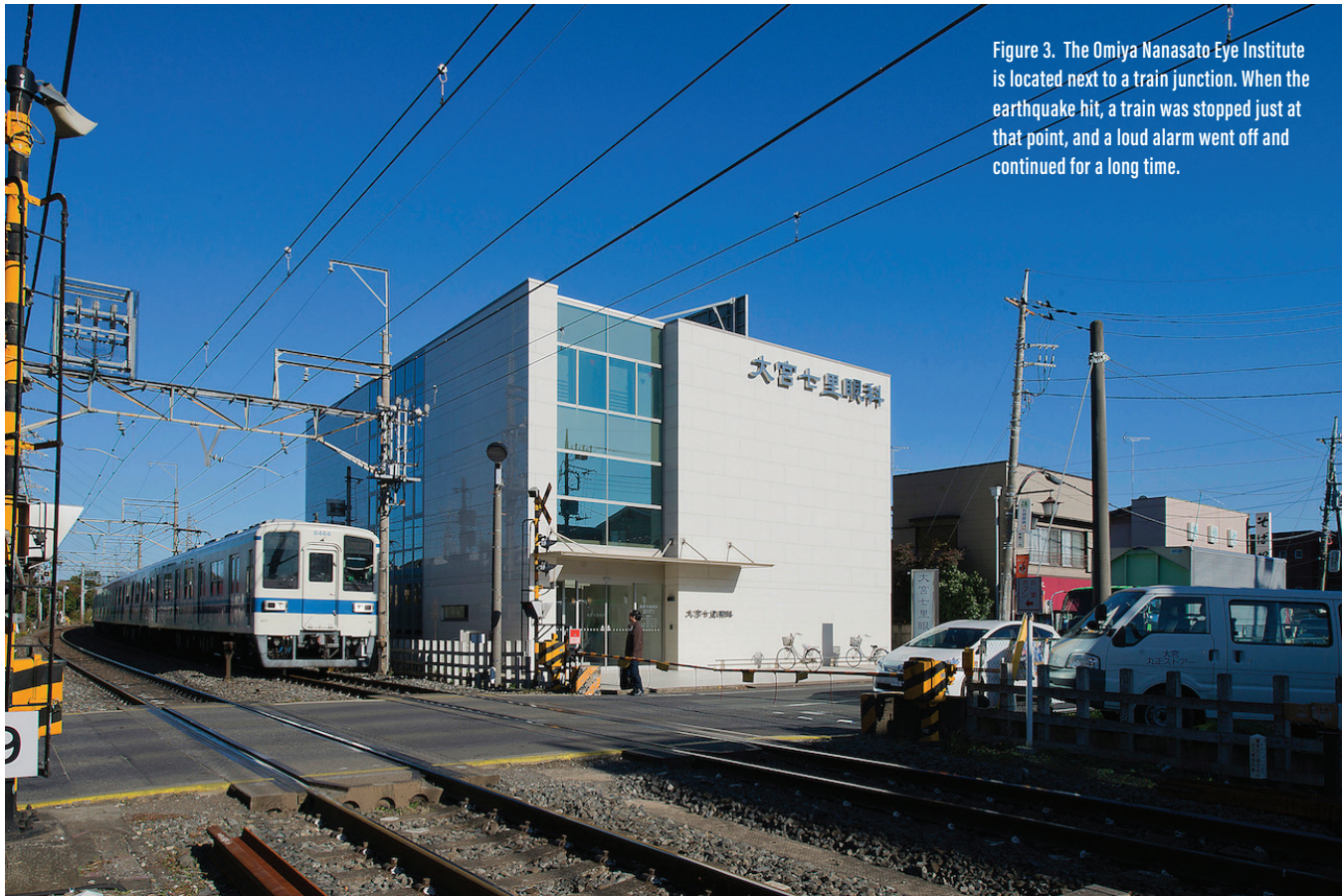
Figure 3. The Omiya Nanasato Eye Institute is located next to a train junction. When the earthquake hit, a train was stopped just at that point, and a loud alarm went off and continued for a long time.

On the following day, all of the patients who had operations the day before came to my clinic for day 1 follow-up examinations. It was determined that the results of all the previous days' surgeries—performed during the earthquake and aftershocks—were positive. It was heartening to hear the happy responses and words of appreciation from the patients and their families.