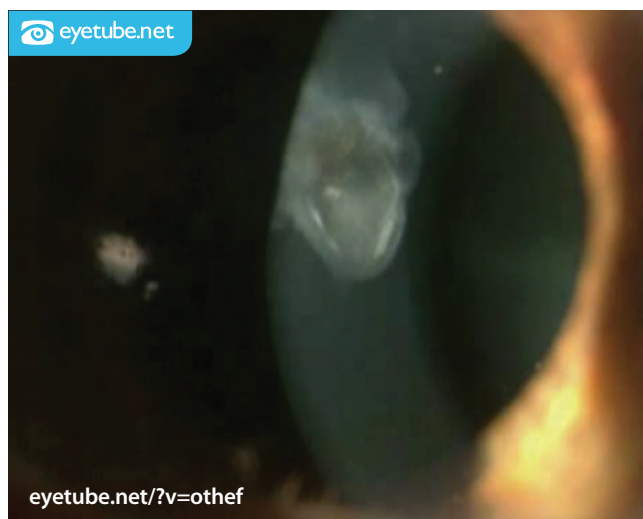
Figure 2. This patient’s eye had a dense, herpetic corneal scar, which Dr. Gulani treated with “in-cornea” laser corneoplastique. Later, the patient underwent a two-step cataract procedure.