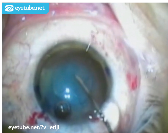
Figure 1. After staining the capsule with trypan blue dye, Dr. Gulani checks the capsulotomy.

A patient was referred to me with a dense white cataract and hand motions vision. A retina specialist had previously accidentally torn the posterior capsule while injecting an antivascular endothelial growth factor. The consistency of the laser for creating a capsulotomy allowed me to plan for a sulcus-based IOL, and the patient achieved a UCVA of 20/25 (Figure 1).