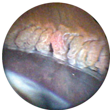
Figure 1. During ECP, the surgeon ablated the ciliary processes so as to shrink and whiten but not pop them.

in order to visualize the ciliary processes. Next, I treated all visible ciliary processes and the intervening crypts. The laser energy and distance from the ciliary processes were titrated based on individual response, but the level was usually between 200 and 300 mW. The laser treatment was enough to cause the ciliary processes to shrink and whiten but not to pop (Figure 1). Up to 270° can be treated through a single incision, and the entire ciliary ring can be treated through two corneal incisions. Once treatment was complete, I completely removed viscoelastic from the eye, administered an intracameral injection of triamcinolone acetonide (Kenalog; Bristol-Myers Squibb) into the anterior chamber, and rinsed out the corticosteroid, leaving a residual amount adherent to the iris. Performing ECP at the end of cataract surgery adds only a few minutes to procedural time.