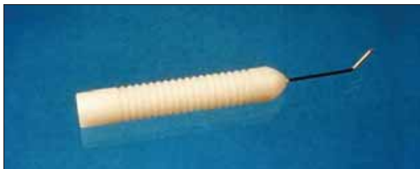
Figure 3. Nichamin A.C. Infusion Cannula No. E4421-S21. (Reprinted with permission from Slack Incorporated. Nichamin LD. Posterior capsule rupture and vitreous loss: advanced approaches. In: Chang DF, ed. Phaco Chop: Mastering Techniques, Optimizing Technology, and Avoiding Complications . Thorofare, NJ: Slack Incorporated; 2004.)

pars plana incision is the enhanced access one has to residual lenticular material. The surgeon may remove cortex, epinucleus, and even fairly dense nuclear material with the vitrector by gradually increasing vacuum and reducing the cutting rate. When addressing vitreous, the surgeon should use the highest cutting rate with the lowest possible vacuum that will permit vitreous aspiration. In this way, he or she can achieve a more complete cleanup and thereby reduce secondary complications such as increased IOP, inflammation, and cystoid macular edema.