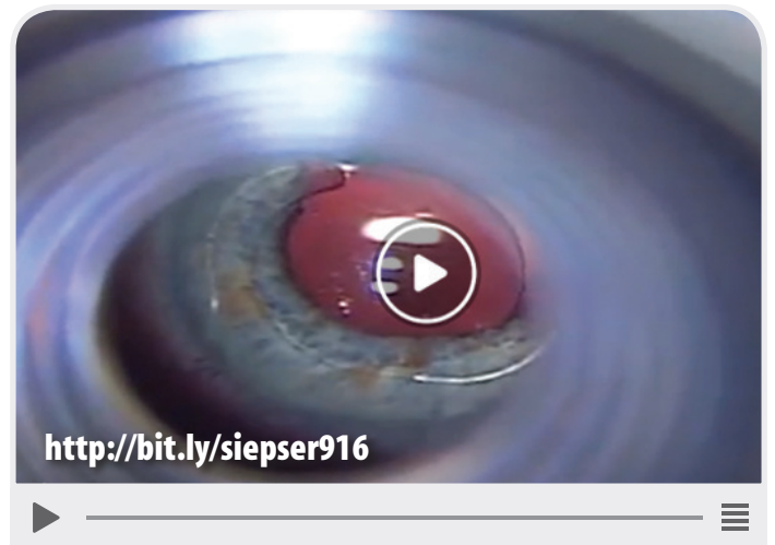
An Anterior Chamber Angle-Fixated IOL Exchange for a Crystalens