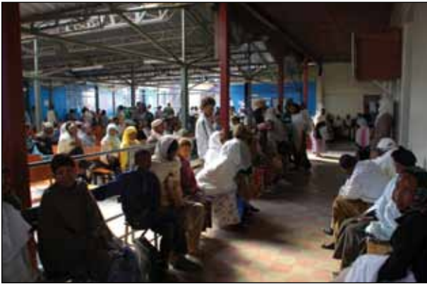
On the first day of each visit, the author evaluates pre-screened patients for possible implantation. Patients have to meet strict inclusion criteria to be considered for surgery.