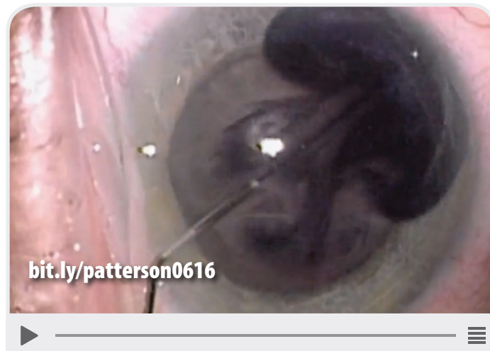
Brown Cataract Phaco Chop