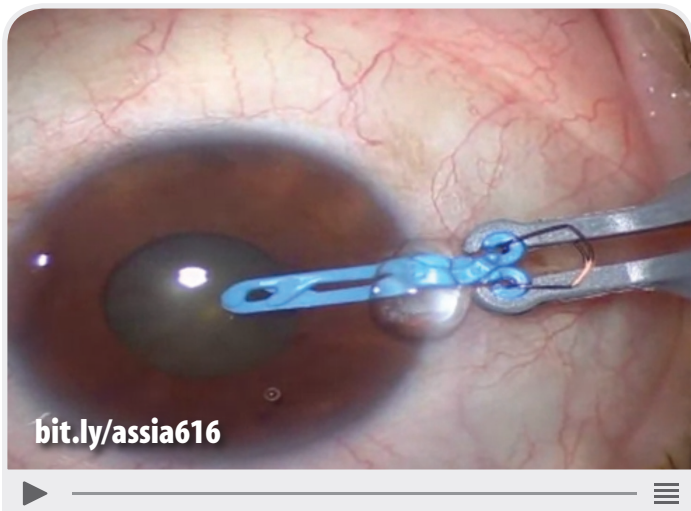
APX 200 in Pupil Not Responsive to Pharmacological Dilation