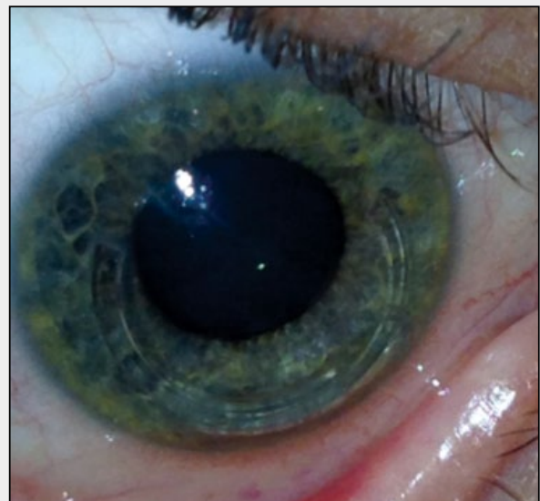
Figure 2. In this eye, the superior segment rests on top of the inferior segment.