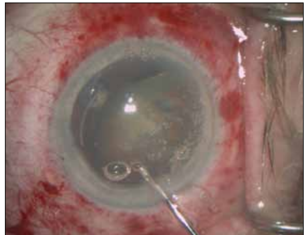
Figure 1. After prechopping with a femtosecond laser, the lens is spun and floated into the anterior chamber as one piece.

In this phaco-free technique, the first step is the creation of the capsulorhexis and the lens' fragmentation (a cylindrical cut and a crosshair lens cut) using the LenSx Laser. The second step is hydrodissection and the floating of the lens, as one piece, into the anterior chamber (Figure 1). The third step consists of cracking the laser-prechopped lens into small fragments using an opposing action of 180° with an ophthalmic viscosurgical device protecting the corneal endothelium (Figure 2). The fourth step is aspiration of the lens frag-