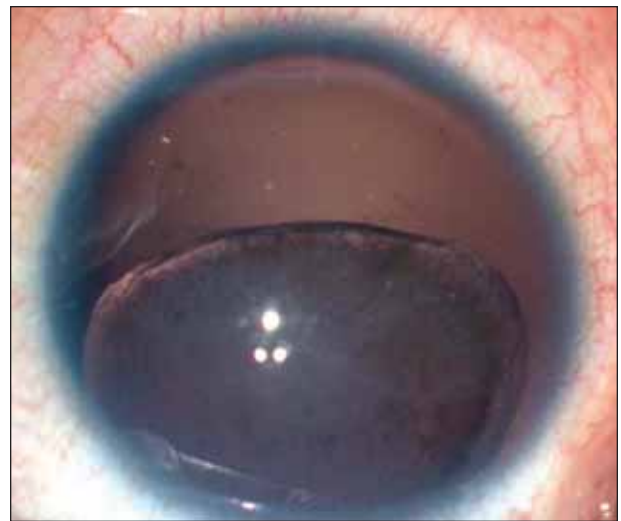
Figure 1. Congenital aniridia with a subluxated cataractous lens.

I did not want to suture an IOL to the sclera in the eye of a child. My concerns about scleral fixation were amplified, because the sutures would have to hold for