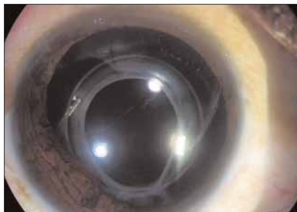
Figure 3. One month after implantation of the Capsular Anchor, in a patient with a traumatic subluxated lens. The blue-colored anchor is seen at 6 o'clock.

We also performed implantation of the Capsular Anchor in three patients with subluxated cataractous lenses. The first case was a 29-year-old man with a 5-hour dialysis of the inferior zonules following blunt trauma. The other two patients had 4- to 6-hour zonular dehiscence and long-standing subluxation secondary to Marfan's syndrome. In all cases, the anchor was inserted before lens removal, and phacoemulsification was performed after the lens was repositioned and secured to the scleral wall. CTRs were implanted in two eyes. In one case, an additional 3-hour dialysis of the superior temporal