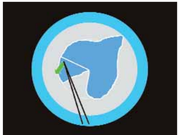
Figure 5. In step five, the surgeon finishes the capsulorhexis.

Once the anterior chamber is deepened with viscoelastic solution, I grasp the middle of the inverted capsular flap rather than at the peripheral base of the tear. Grasping the flap at the peripheral base can cause the radial tear to extend further out to the periphery.