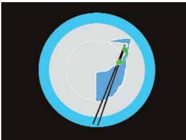
Figure 3. In step three, the surgeon pulls centrally to bring the edge of the capsulorhexis back to the desired size.