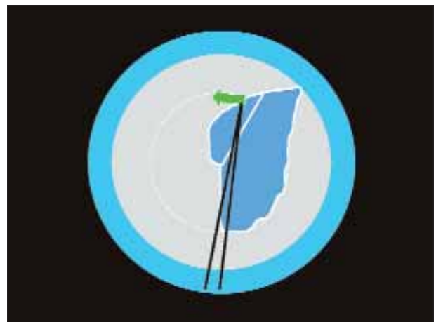
Figure 4. In step four, the surgeon resumes the usual method of creating a capsulorhexis.

After investigating and correcting any of the possible causes, as the next step, I inflate the anterior chamber with the proper amount and type of viscoelastic solution. The anterior chamber should be inflated enough to flatten the lens diaphragm without over inflating. I choose a type of viscoelastic based on my goal for the surgery. A dispersive, highly retentive form, such as chondroitin sulfate, will maintain the chamber better, whereas the cohesive form, such as sodium hyaluronate, allows for easier handling of the capsular flap.