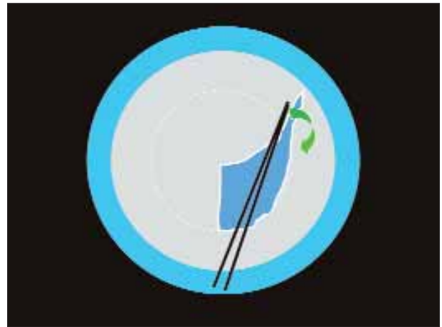
Figure 2. In step two, the surgeon pulls backward and curves in to retrieve the capsulorhexis.