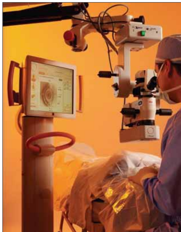
Figure 1. The ORange in the OR.

As small and compact as the ORange is, its large dynamic range (-5.00 to +20.00 D) exceeds that of office-based wavefront aberrometry systems. Conventional wavefront technologies such as Shack-Hartmann are capable of measuring refractive power in a limited dynamic range, typically from -10.00 to +8.00 D. The