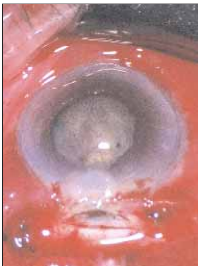
Figure 1. The immediate appearance of the wound following a corneoscleral burn.

The stage was now set. In order to avoid further collapse of the barely formed anterior chamber, I re-inserted the phaco probe without irrigation and then committed