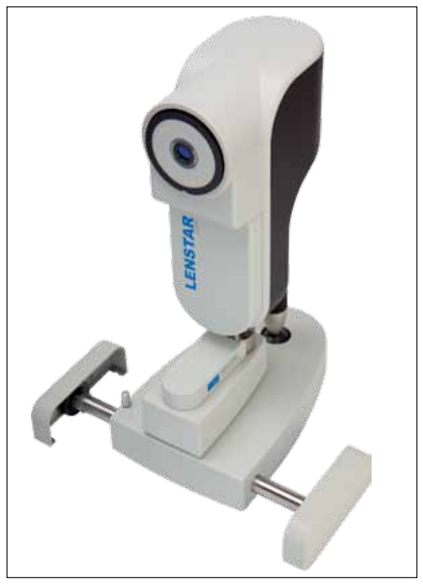
Lenstar is the only optical biometer available that measures lens thickness—one of the key parameters for improved refractive outcomes.

—Warren E. Hill, MD, FACS, Mesa, Arizona