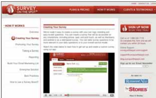
Survey on the Spot tutorial.

word-of-mouth advertising that contributes to reduced costs for acquiring new patients as well as a long-term revenue stream for the practice," he says. "When patient loyalty is increased as little as 5%, profits can be increased as much as 25% to 85%. The more positive the experience [is], the more worth or value the patient will feel the service has."