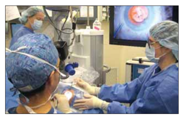
Figure 1. Configuration of the TrueVision 3D HD system.

Similarly, one of the challenges of adopting biaxial phacoemulsification, with the separation of infusion and aspiration, is learning the most effective placement of the phaco tip and irrigating chopper relative to each other in the vertical plane. If the stream of irrigating fluid washes material away from the phaco tip, it prolongs the procedure and may set the stage for surgical re-intervention if the surgeon leaves a piece of nucleus in the angle or the sulcus. In addition, keeping the stream high up in the chamber in cases of intraoperative floppy iris syndrome prevents the iris from