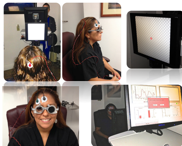
Figure 1. Clinical setup of the Diopsys SD-tVEP testing system. ERG studies can be performed using the same apparatus with adhesive lower-lid skin electrodes.

The proportion of eyes designated as suspicious or abnormal by the Diopsys Nova-LX scoring algorithm was determined for patients with differing perimetric disease severity based on their latest HFA 30-2 visual field (mild, mean deviation (MD) > -6 dB; moderate, -6 to -12 dB; severe, MD < -12 dB). We compared latency failure with HFA Guided Progression Analysis acquired over the preceding 4 to 7 years to determine whether a single VEP test might help to identify eyes at increased risk of