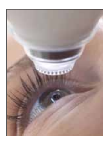
Figure 1. Applicator and suction ring used for VisuMax laser treatment.

eLEx is a recently developed laser corneal refractive procedure based on extraction of an intrastromal lenticule. ReLEx can be performed only with the VisuMax femtosecond laser (Carl Zeiss Meditec AG), which is capable of intrastromal cutting in three dimensions from the corneal surface. In this procedure, a lenticule-a disc of corneal stromal tissue—is cut with micron-scale precision by the laser, and the refractive error is corrected when the surgeon dissects the remaining bridges of corneal tissue and removes the lenticule. Lenticular shape and size are based on mathematical calculations for correcting a specific refractive error.