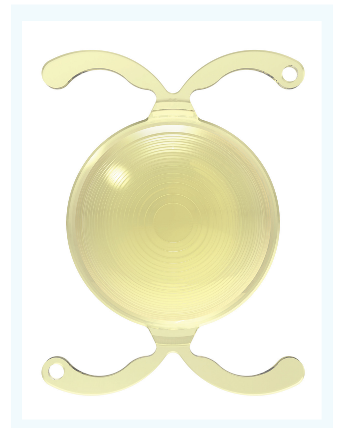
Figure 2. The FineVision lens is a trifocal design.

LASIK flap or in a 150-µm corneal pocket. No special instrumentation is needed to place or center the inlay. Fibrosis has led to the removal of the device in a small percentage of cases, and an average loss of 1 line of distance vision in the treated nondominant eye is typical.<sup>2</sup> (For more information on this implant, please see Dr. Chu's article on p. 48 and visit beye.com/841.)